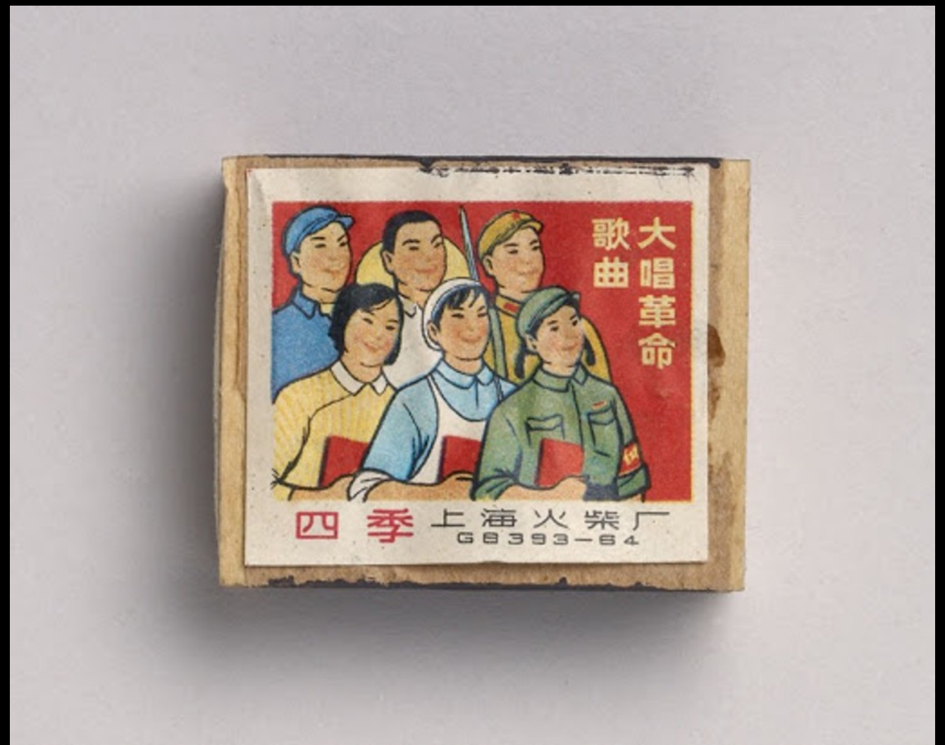
Matchbox depicting figures singing revolutionary songs