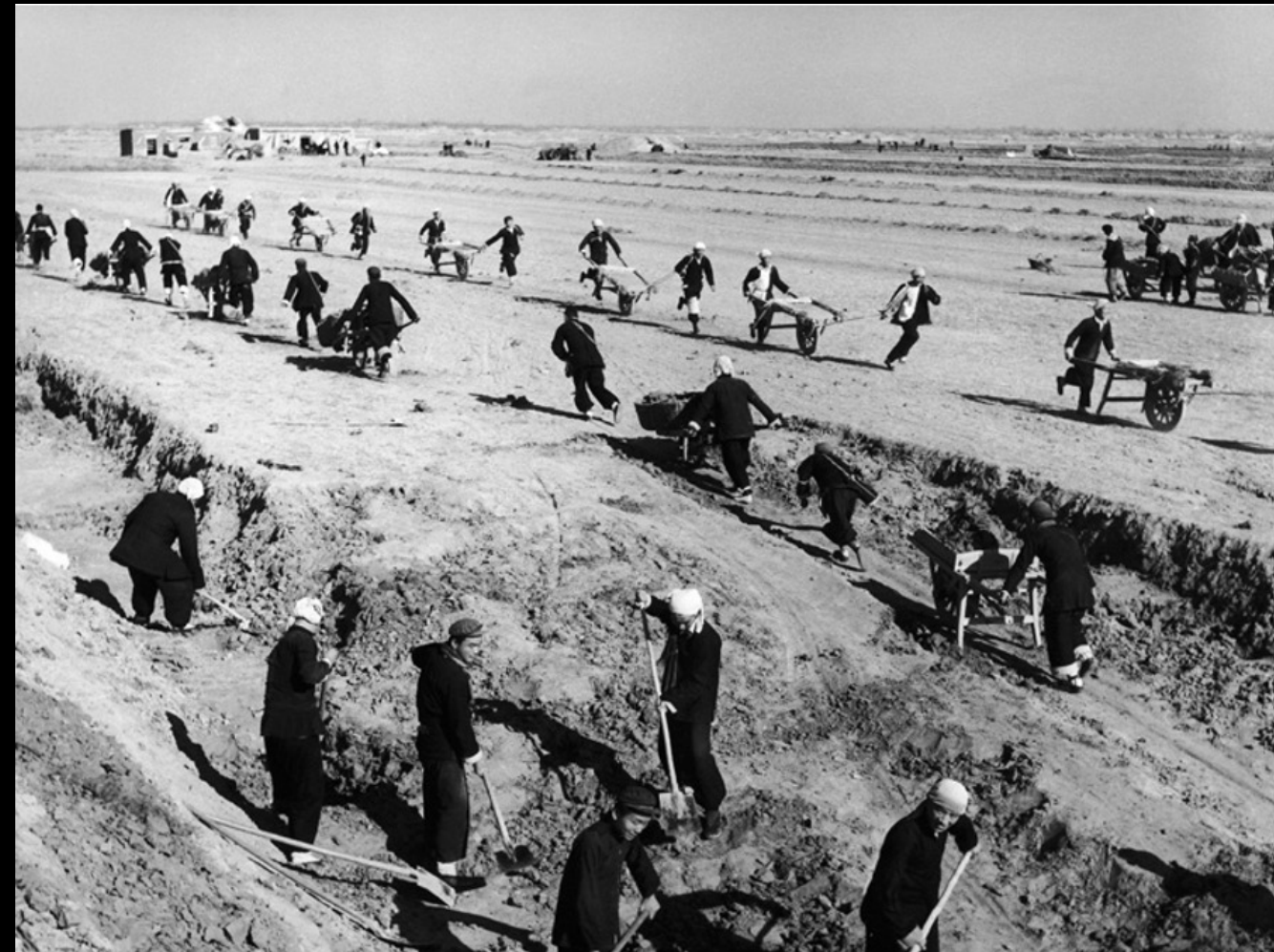
Farming during the Great Leap Forward