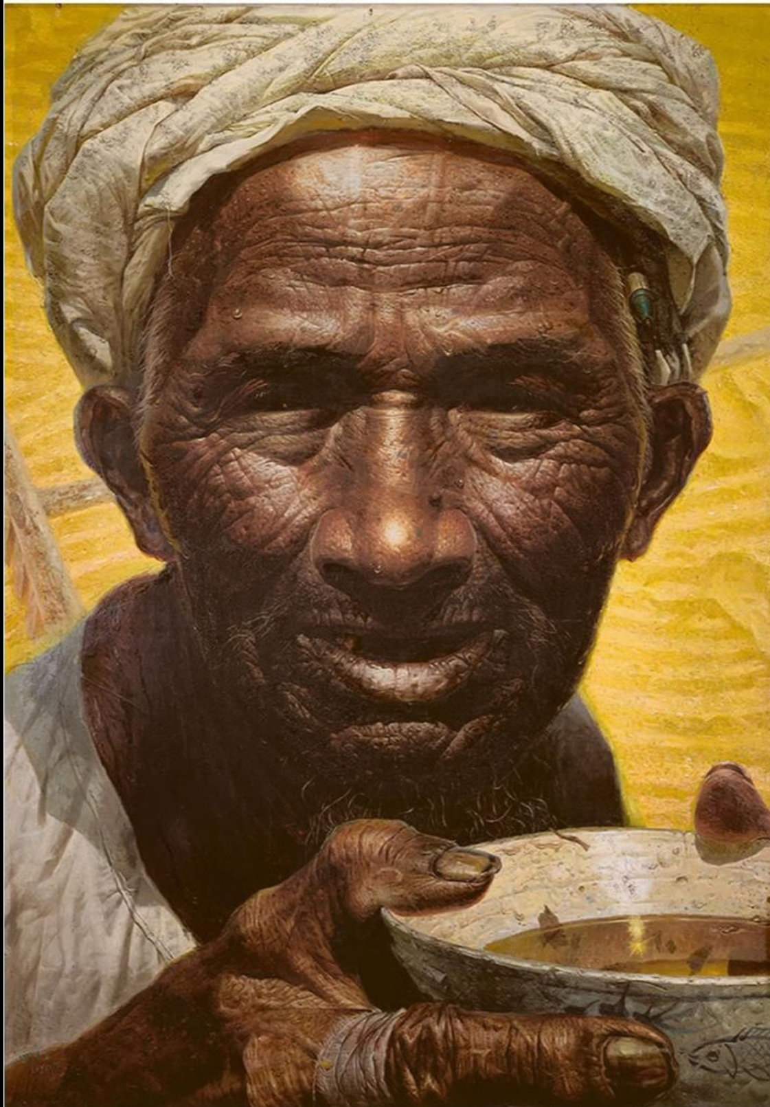
Luo Zhongli Father 1980 Oil on canvas