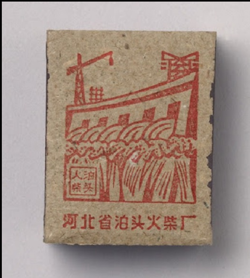
Matchbox depicting new construction in Hebei