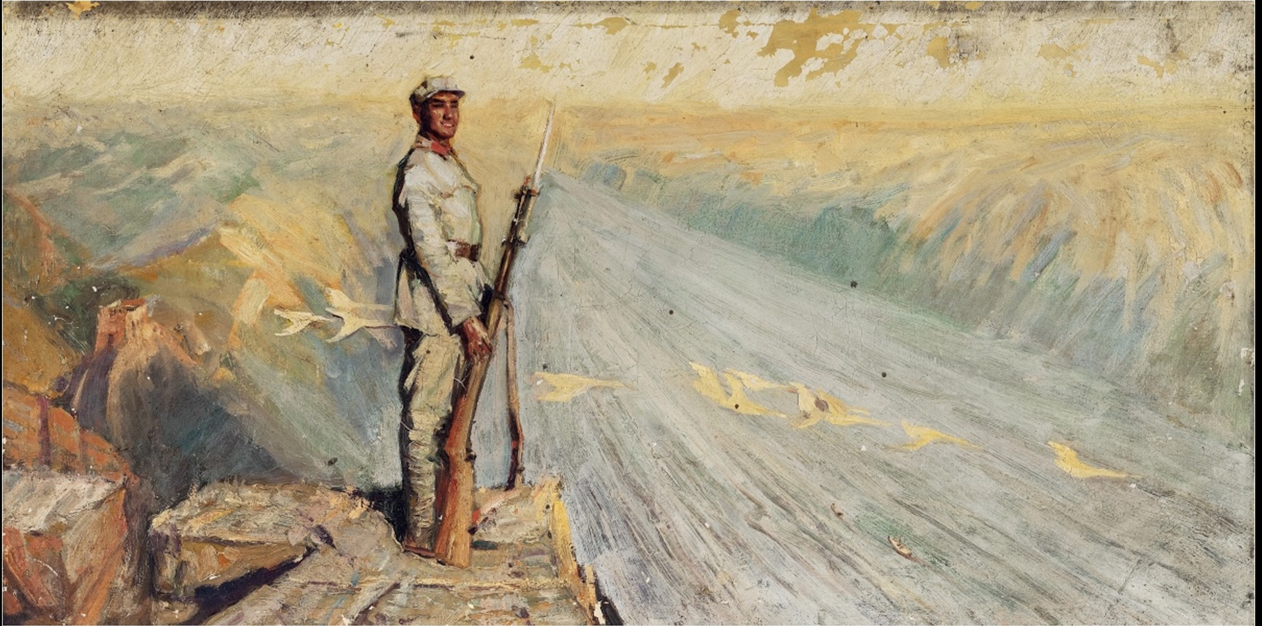
Chen Yifei Eulogy to the Yellow River. Oil on canvas 1972

"In the red army soldier's rifle shoulder strap was a little piece of red fabric, like a blossoming fresh flower... I felt it was so beautiful, and heroic, as well as romantic." -Chen Yifei