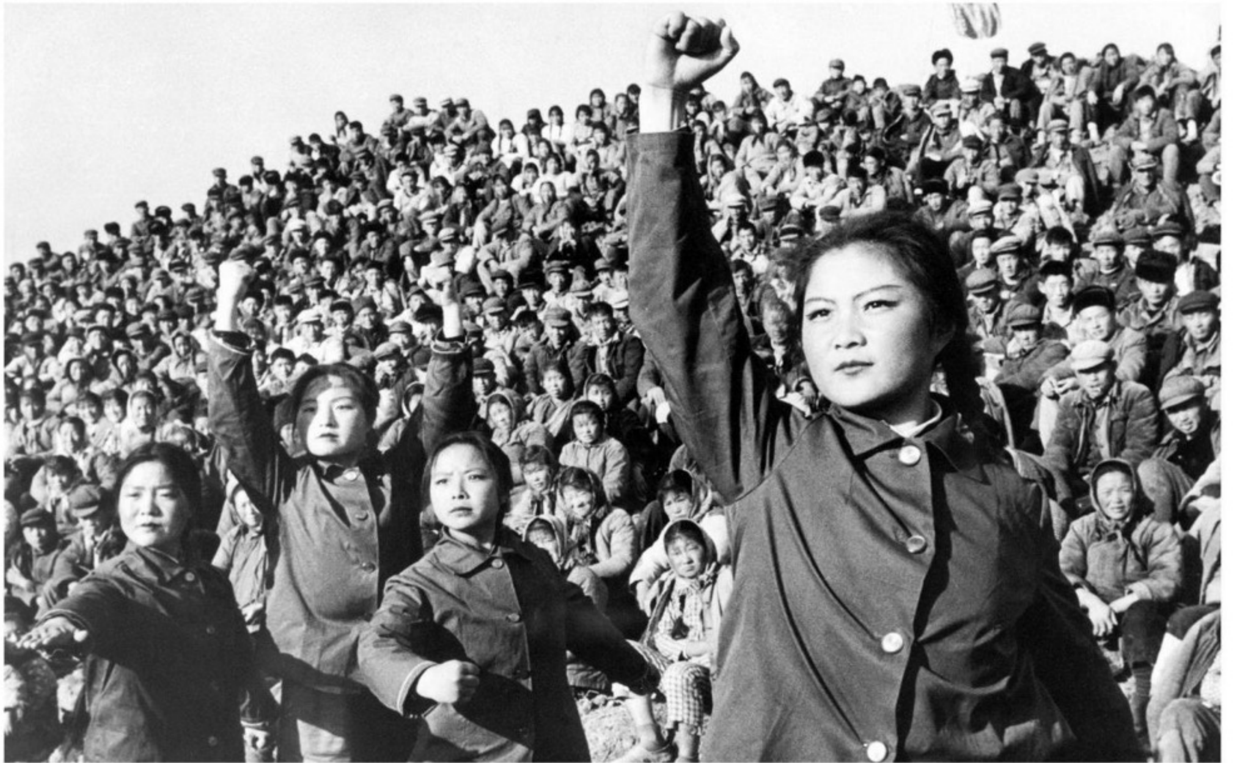
Chinese red guards during the cultural revolution in China 1966