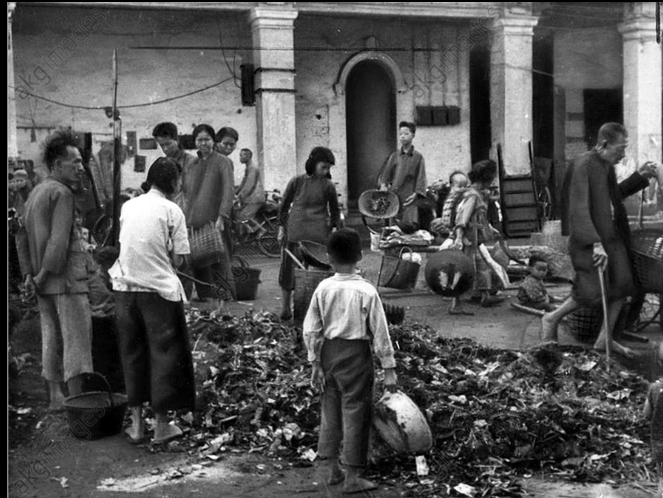
Collecting old pots, pans and scrap metal for 'backyard furnaces' during the Great Leap Forward (1958-60)